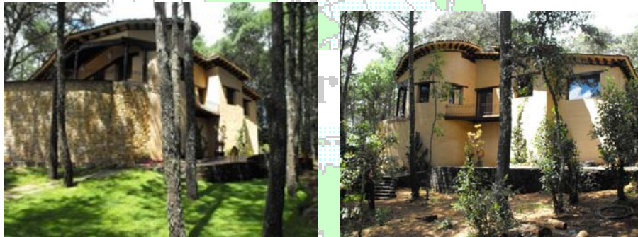
Lake View - Mountain Lake Retreat Casitas